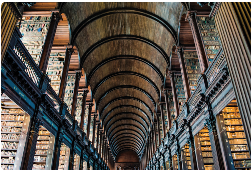
While hard to visualize today, a key research tool of ancient times was the library. This photo is courtesy of Neil Cooper and is freely downloadable on Unsplash. Unsplash.com, like Pixabay.com and others, is a website dedicated to sharing photographs with a reuse-friendly copyright for both commercial and noncommercial purposes.

I cannot imagine working on documents without sharing and communication tools such as video conferencing, collaborative online document editors, and version control systems. Regarding video conferencing, after decades of watching sci-fi movies, we are finally living in the age of face-to-face and multiparty calls! All major offerings are from commercial entities (easy to find online) and offer quite reasonable free versions. Unfortunately, there is no standard or best solution, and it